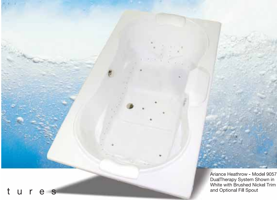
Ariance Heathrow - Model 9057 DualTherapy System Shown in White with Brushed Nickel Trim and Optional Fill Spout