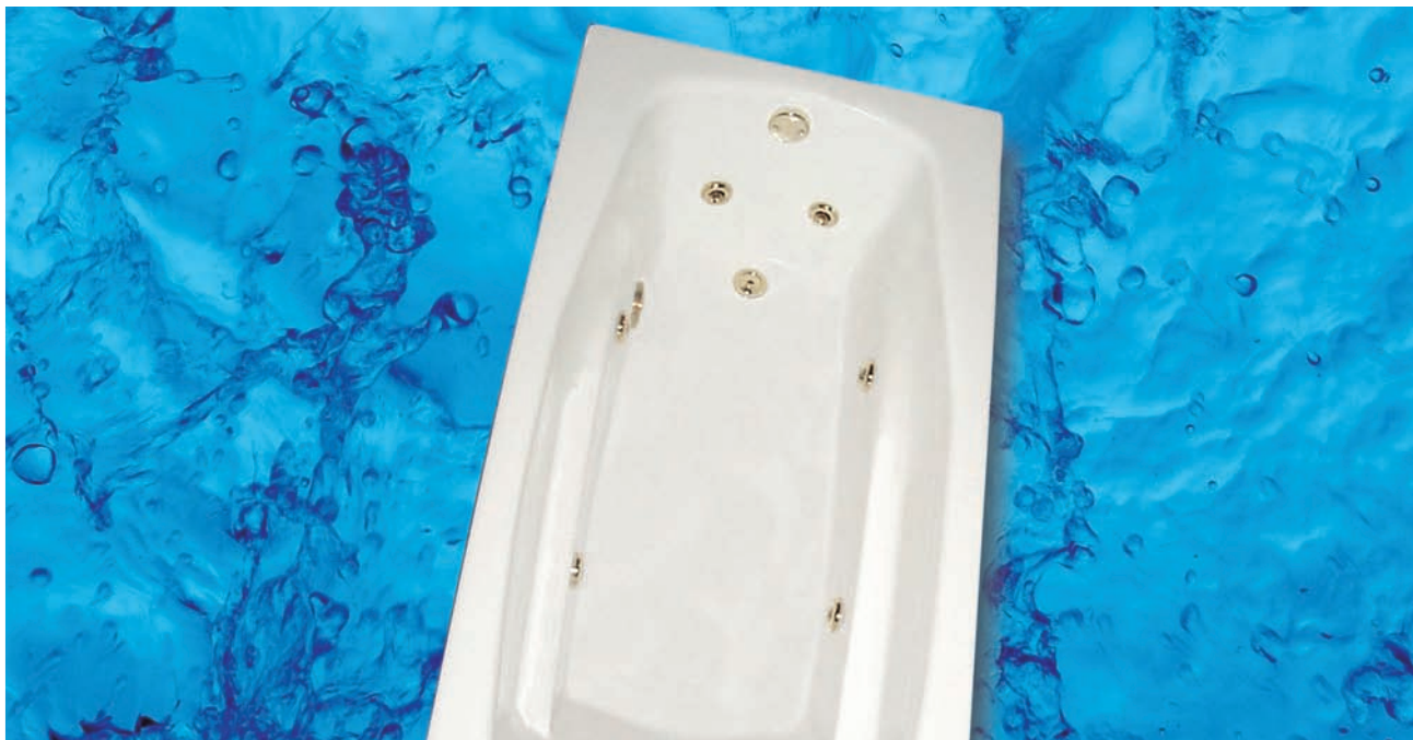
Model 6053 Shown in White with EverBrass (PVD) trim