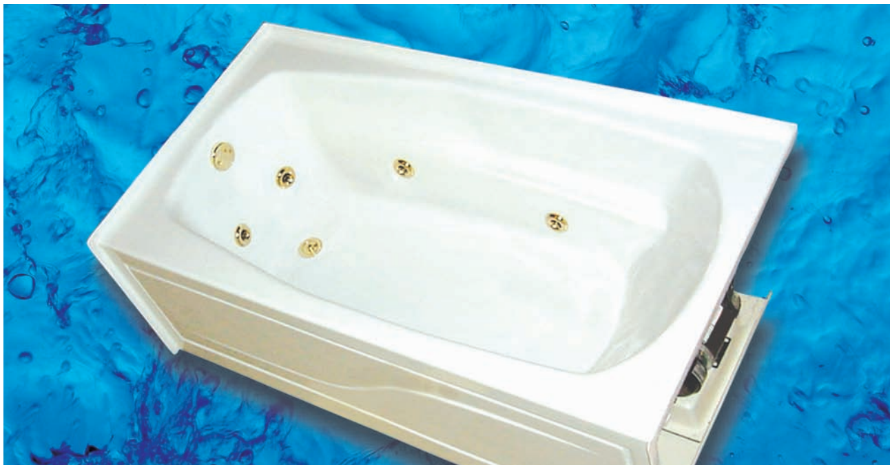
Model 6153 Shown in White with EverBrass (PVD) trim