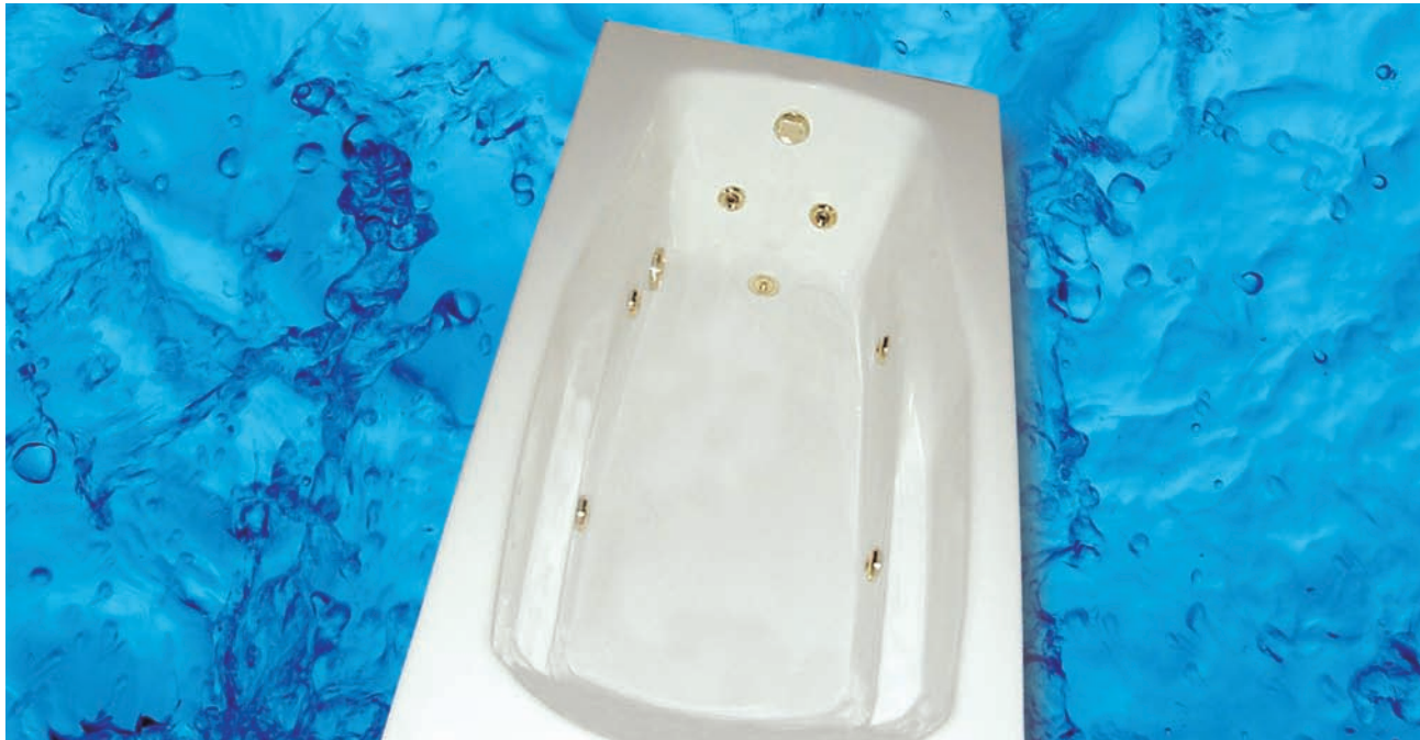
Model 6021 Shown in White with EverBrass (PVD) trim