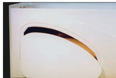
Optional Removable Access Panel