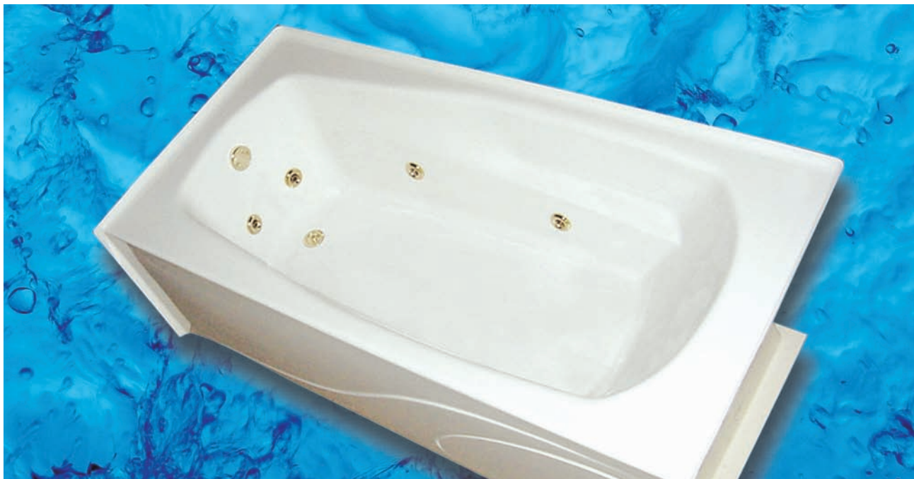
Model 6123 Shown in White with EverBrass (PVD)