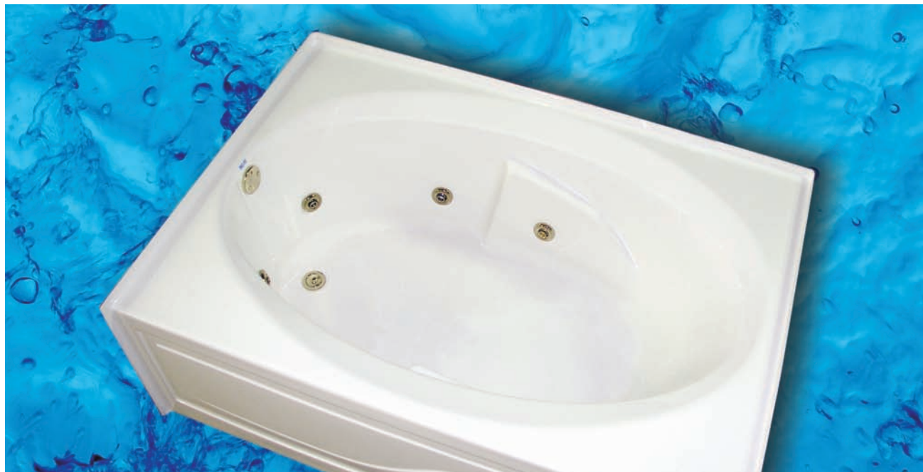
Model 6124 Shown in White with EverBrass (PVD) trim