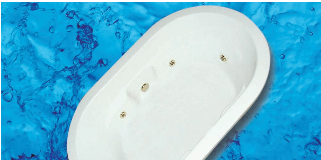
Model 6028C Shown in White with EverBrass (PVD) trim