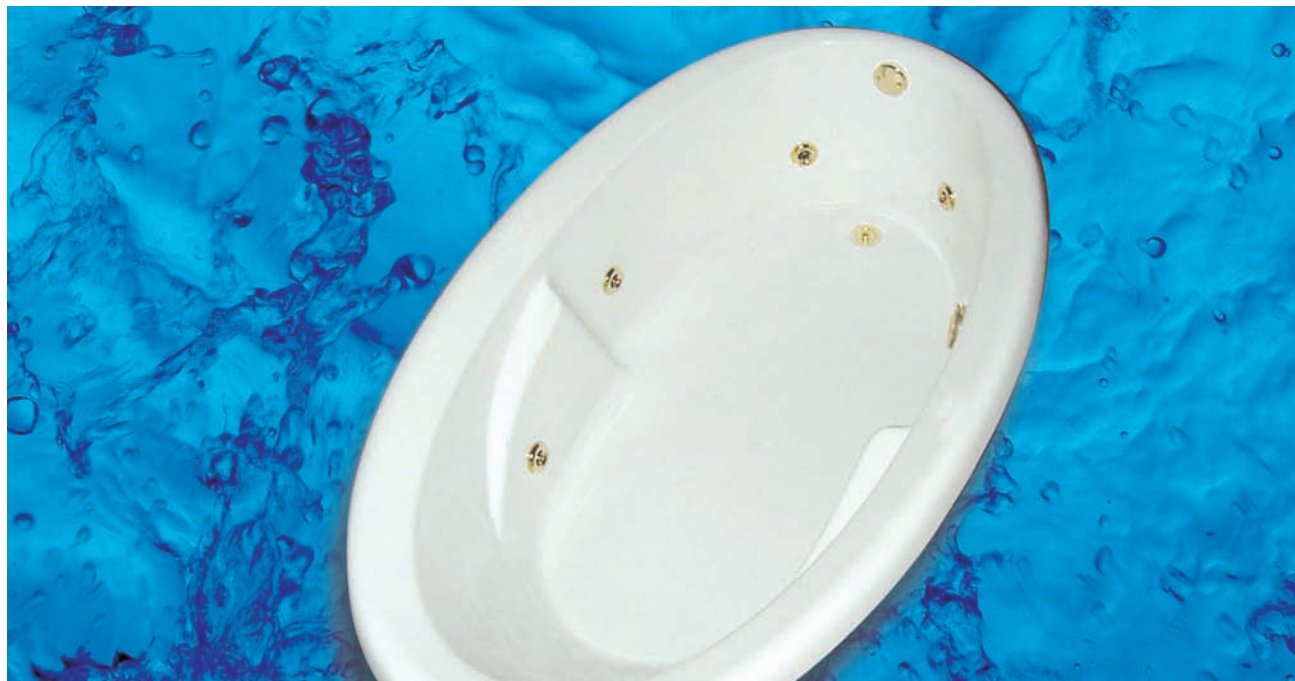
Model 6028E Shown in White with EverBrass (PVD) trim