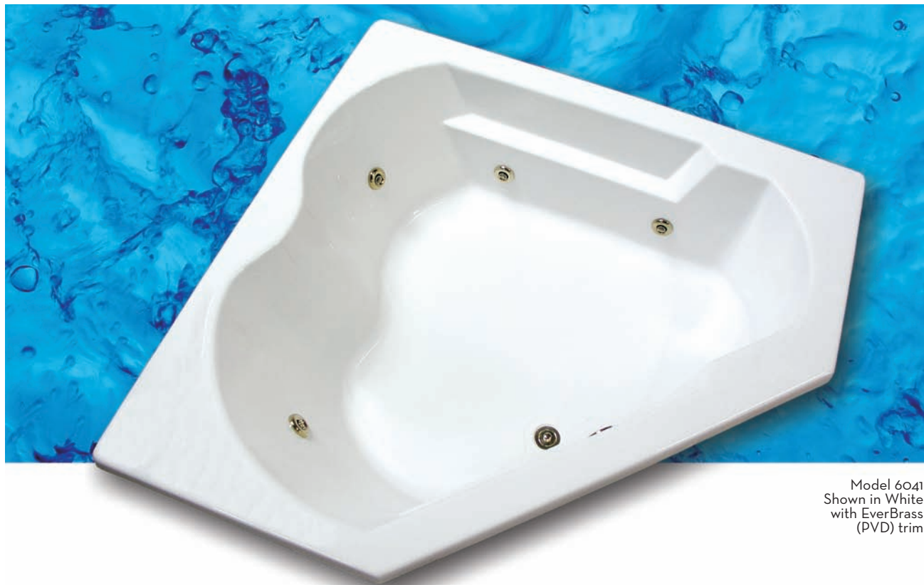
Model 6041 Shown in White with EverBrass (PVD) trim